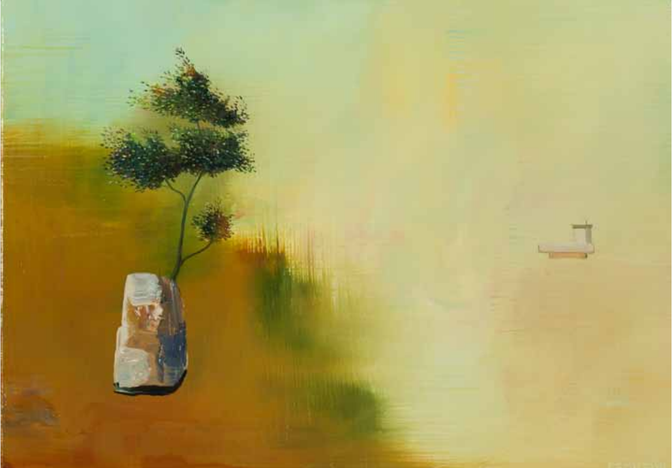
Hermit's Ruin 3, 2013, oil on panel, 5”x 7”