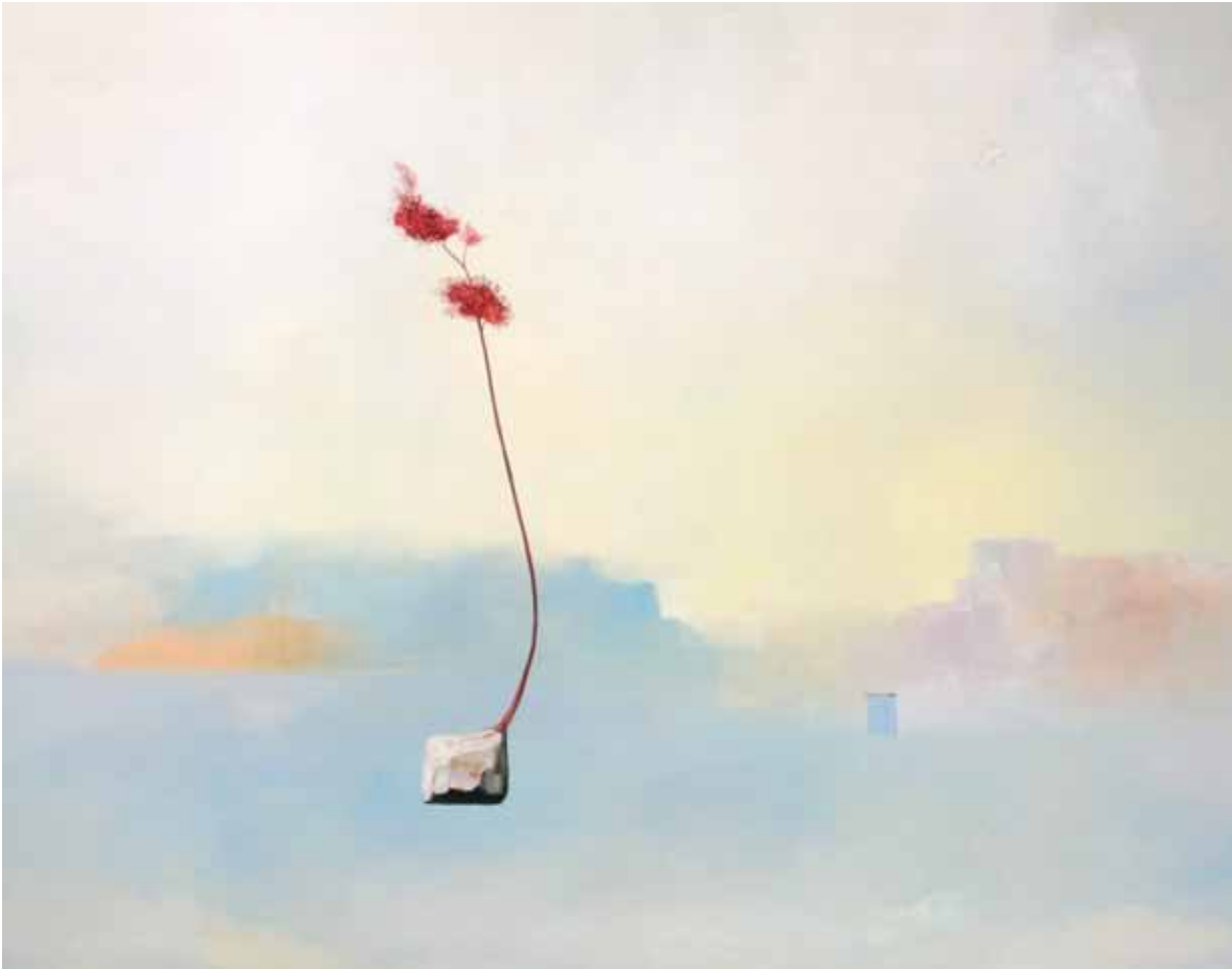
Red Tree 2, 2013, oil on panel, 16”x 20”

in the sides of the Apennines; or we may have seen them dotting the same kinds of hills and dales in landscape painting from the 15th and 16th centuries. Indeed, Frontini’s imagery has been compared to that of the proto-Renaissance, and to a certain extent we might consider him the latest Sienese miniaturist.