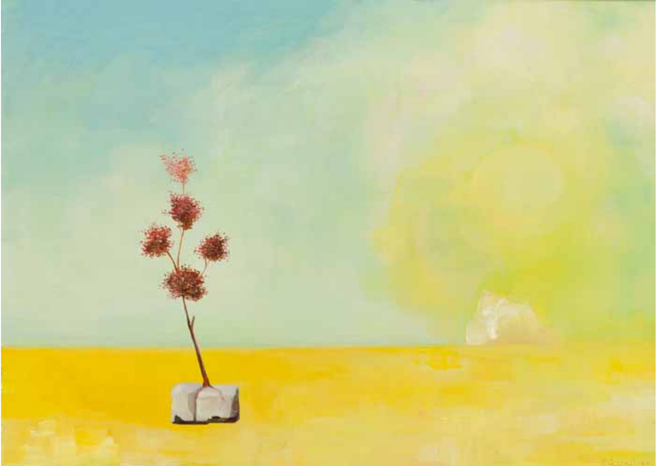
Red Tree 1, 2013, oil on panel, 5"x 7"