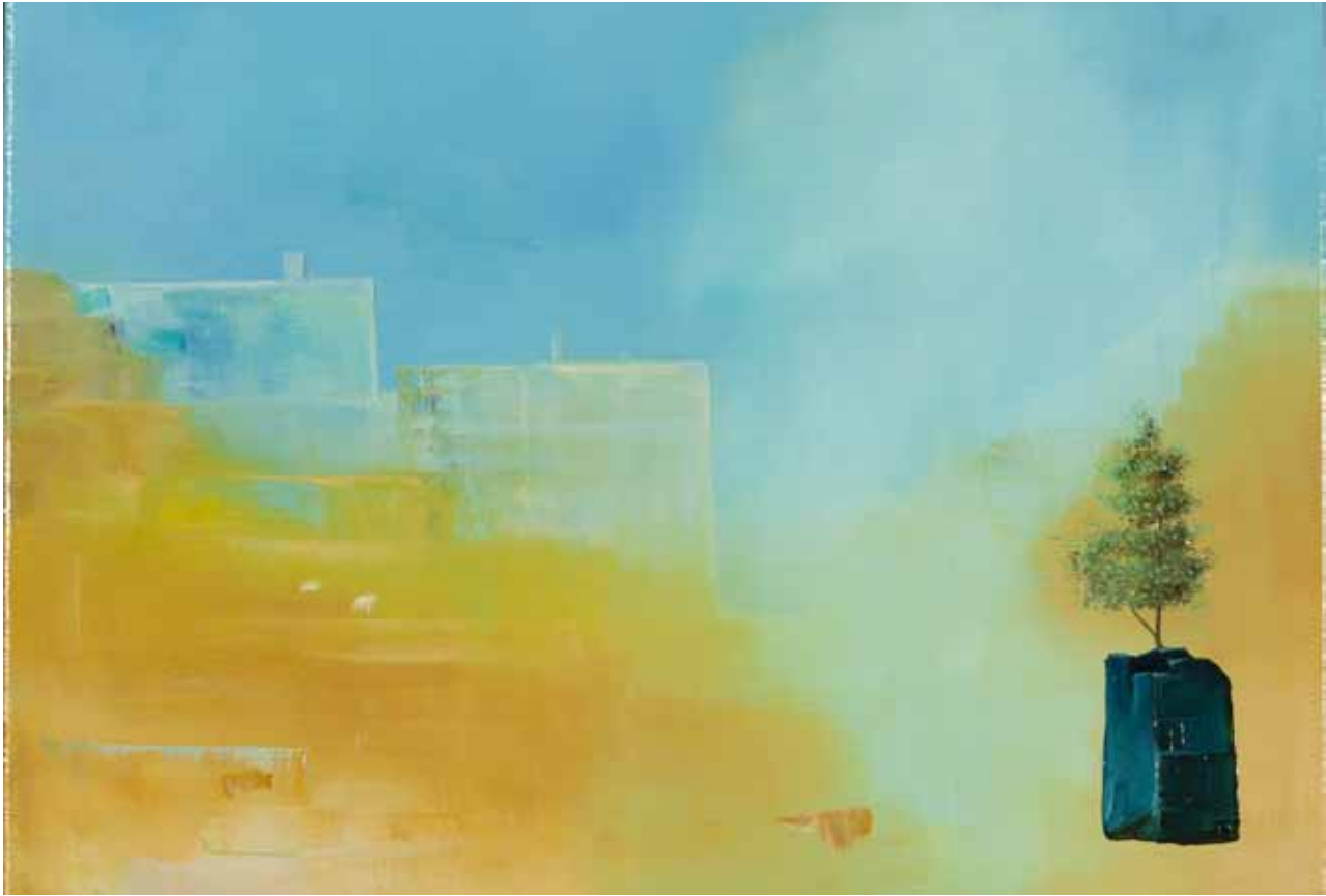
Blue Rock 2, 2013, oil on panel, 5”x 7”