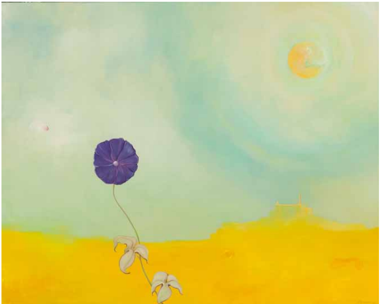
Yellow Factory, 2013, oil on panel, 16" x 20"

Front Cover: Red Flower, 2013, oil on panel, 20" x 16"