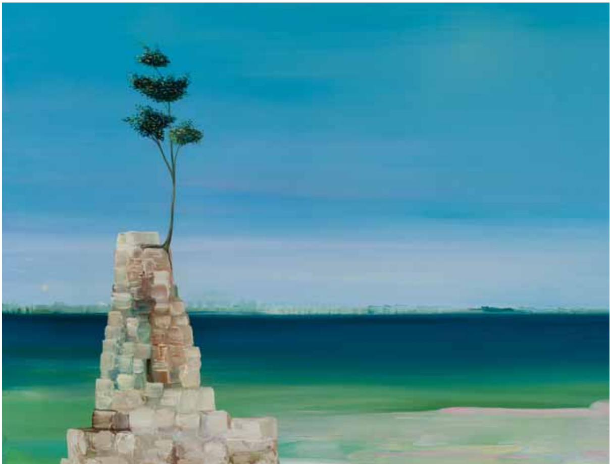
The Other Shore 3, 2013, oil on panel, 11” x 14”