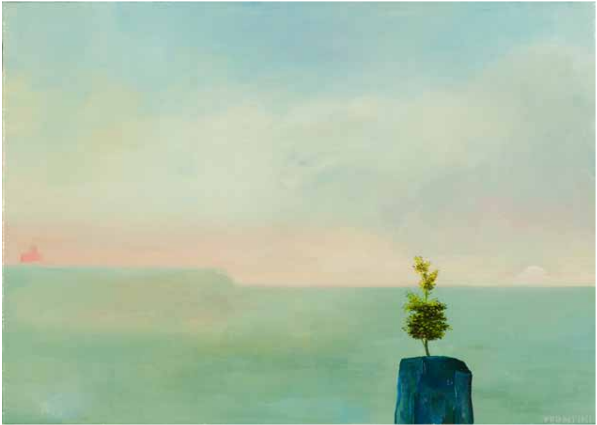
Blue Rock, 2013, oil on panel, 5”x 7”