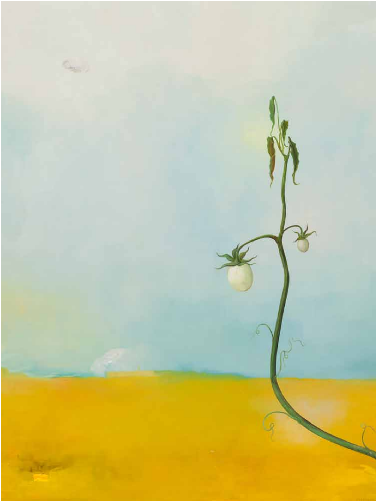
On the Vine, 2013, oil on panel, 20"x 16"