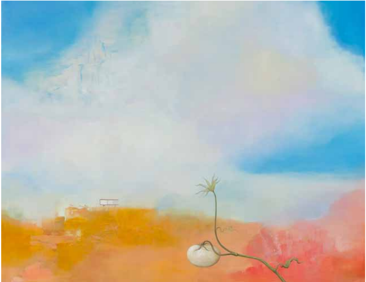
White Tomato, 2013, oil on panel, 14”x 16”