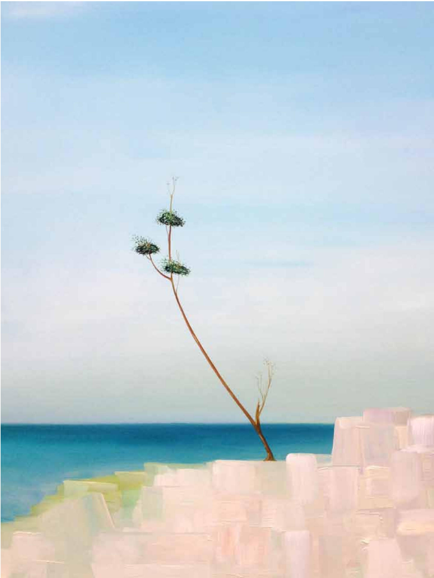
Lone Tree, 2013, oil on panel, 14"x 11"