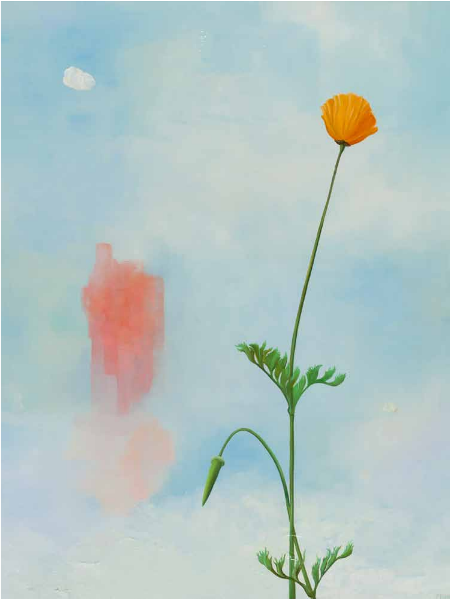
Orange Poppy, 2013, oil on panel, 20"x 16"