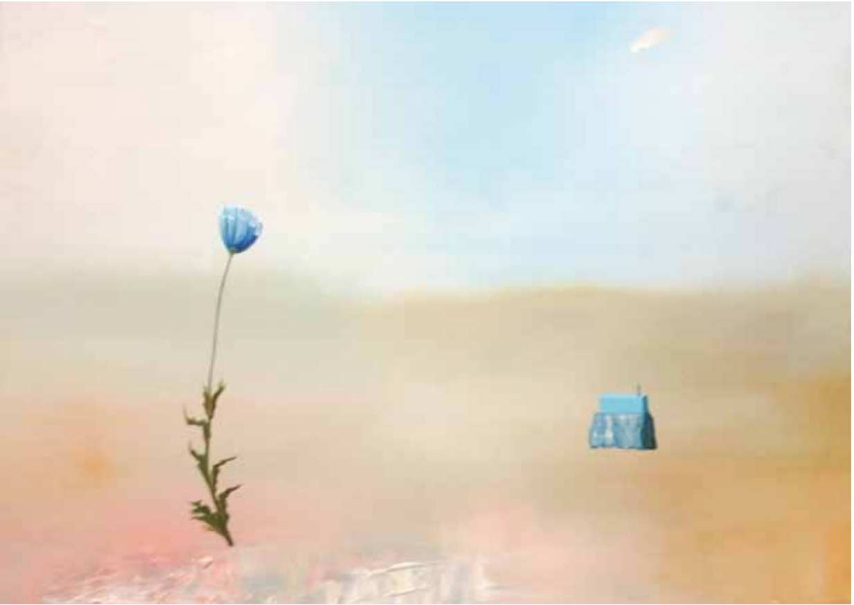
Blue Factory, 2013, oil on panel, 16"x 20"