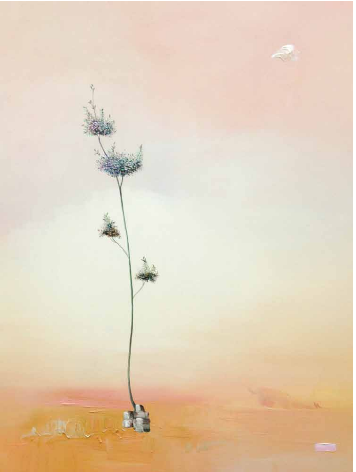
Desert Tree, 2013, oil on panel, 20"x 16"