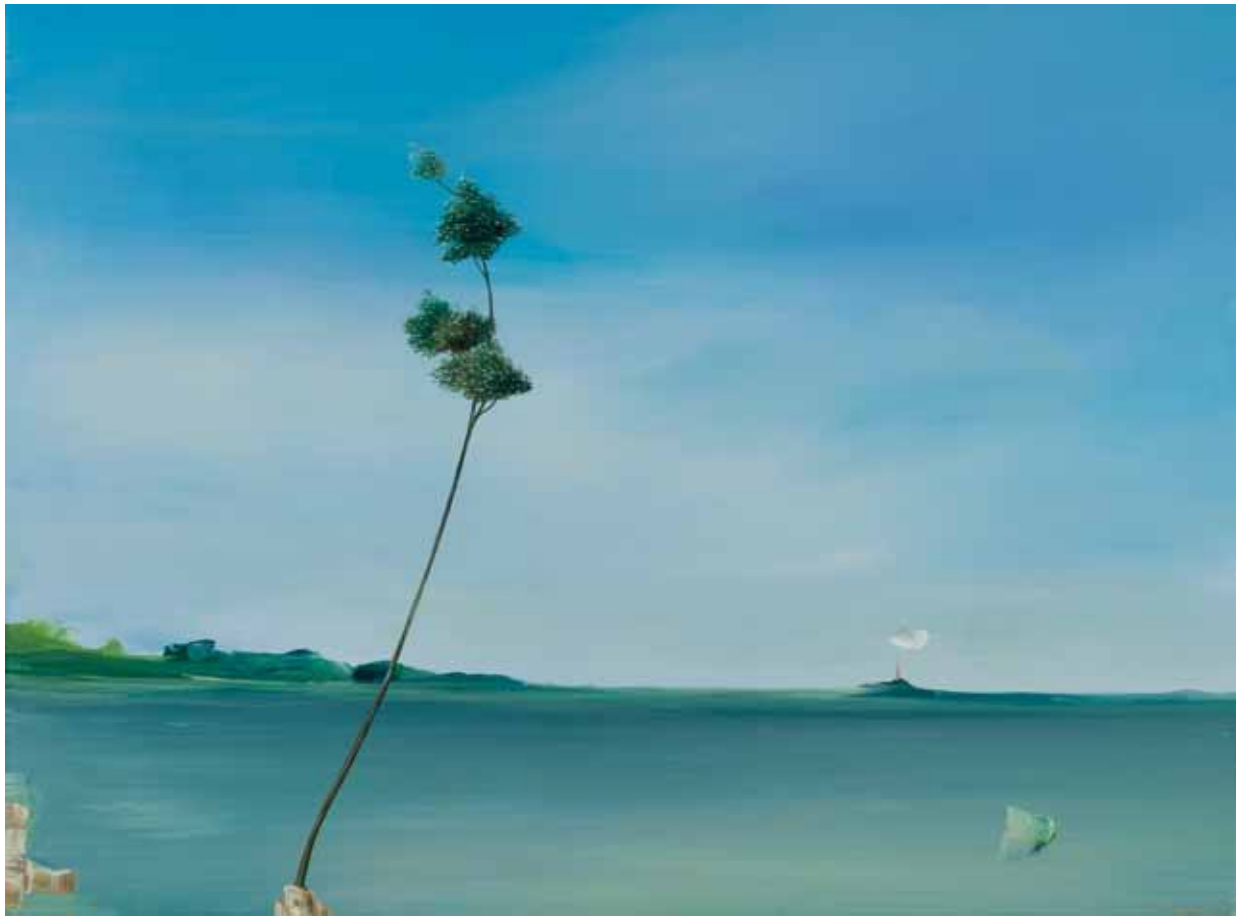
The Other Shore 2, 2013, oil on panel, 11” x 14”