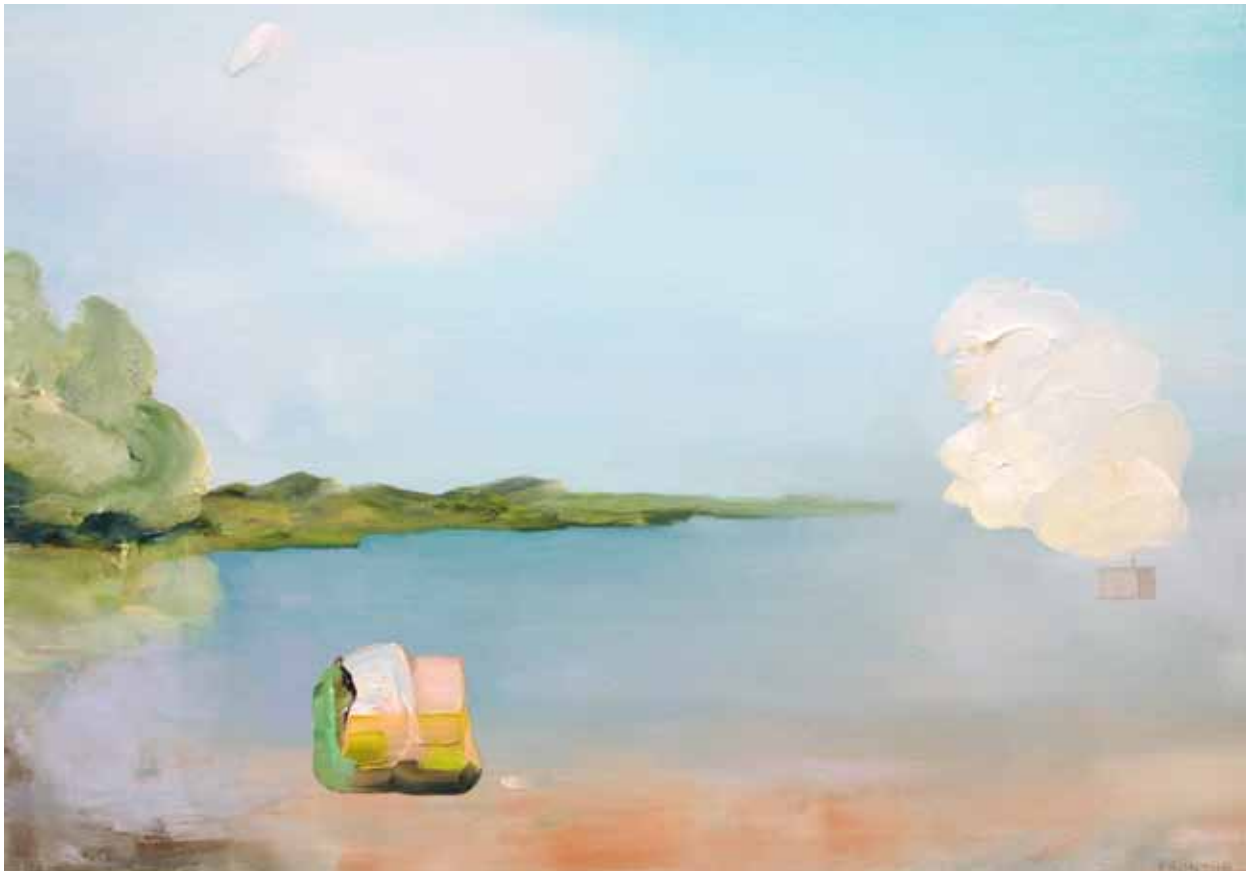
Glacial Rock, 2013, oil on panel, 11”x 14”