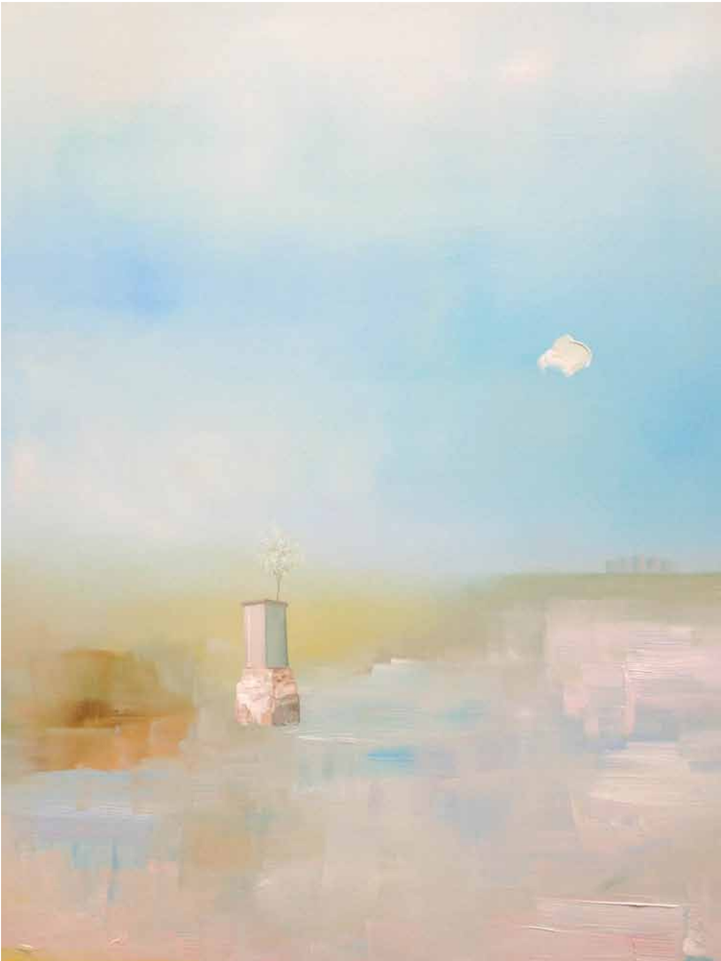
Dream Home, 2013, oil on panel, 20"x 16"