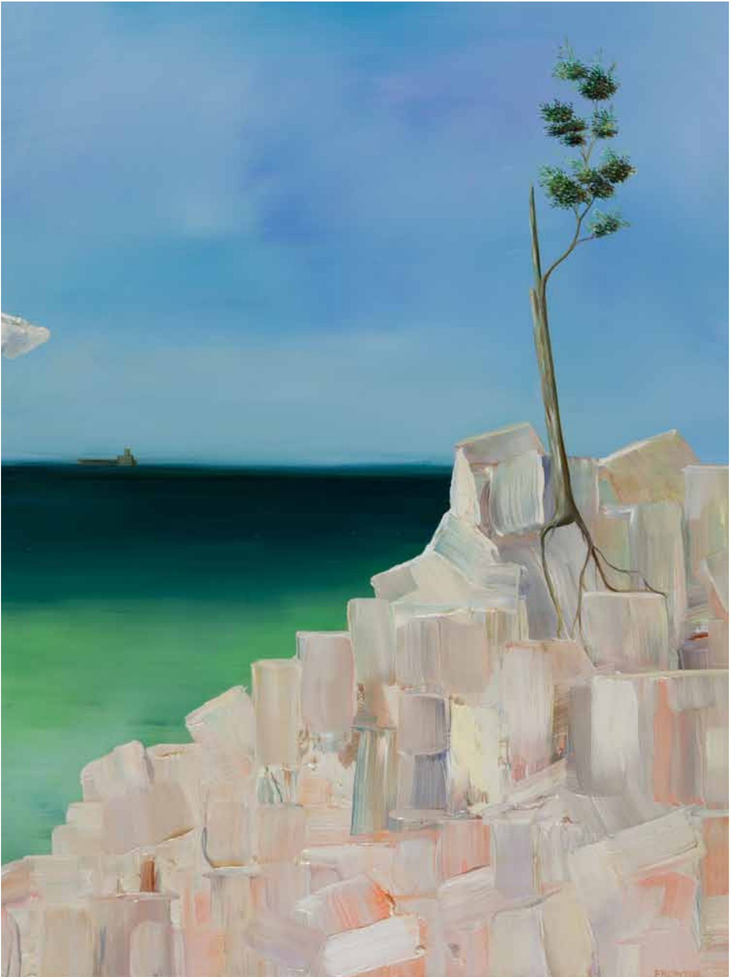
The Other Shore 3, 2013, oil on panel, 14"x 11"