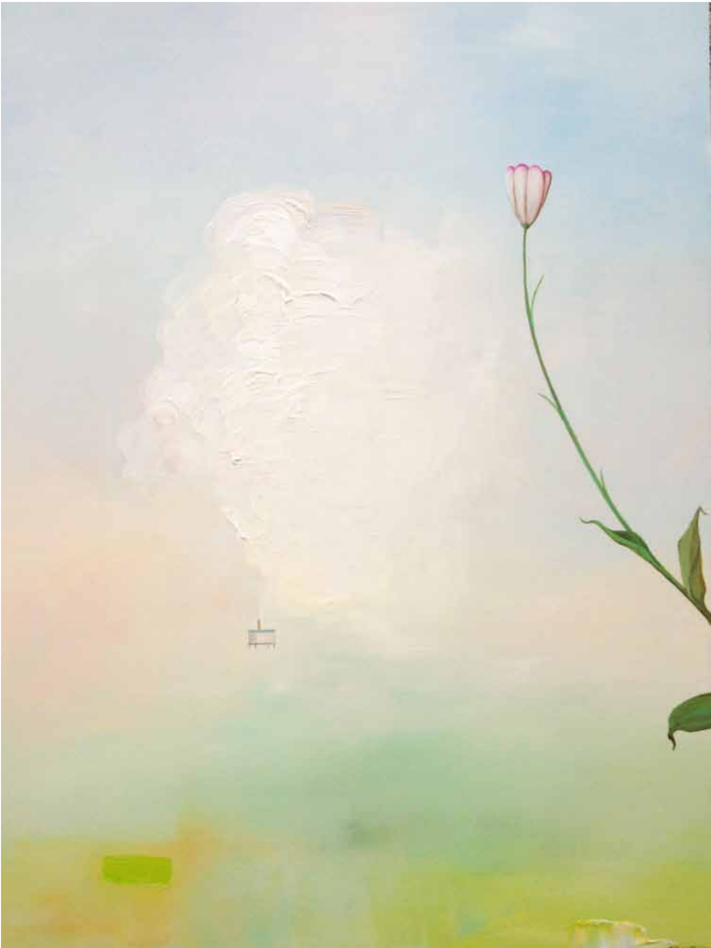
White Blossom, 2013, oil on panel, 20”x 16”