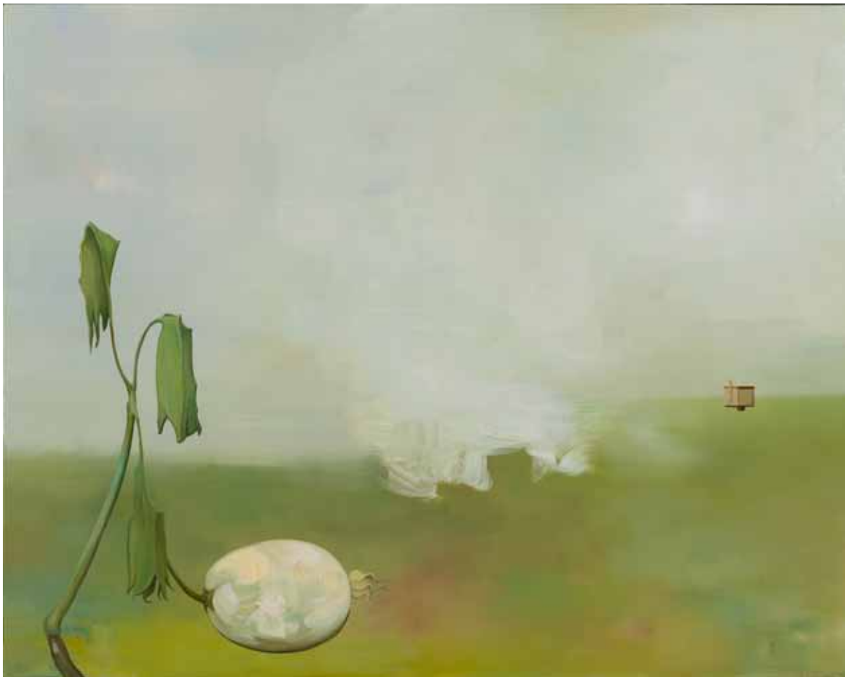
Melon, 2013, oil on panel, 16”x 20”