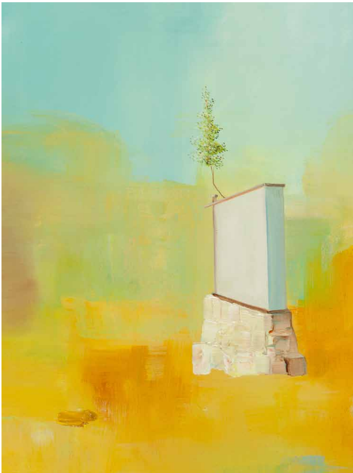
Northern Dream House, 2013, oil on panel 7”x 5”