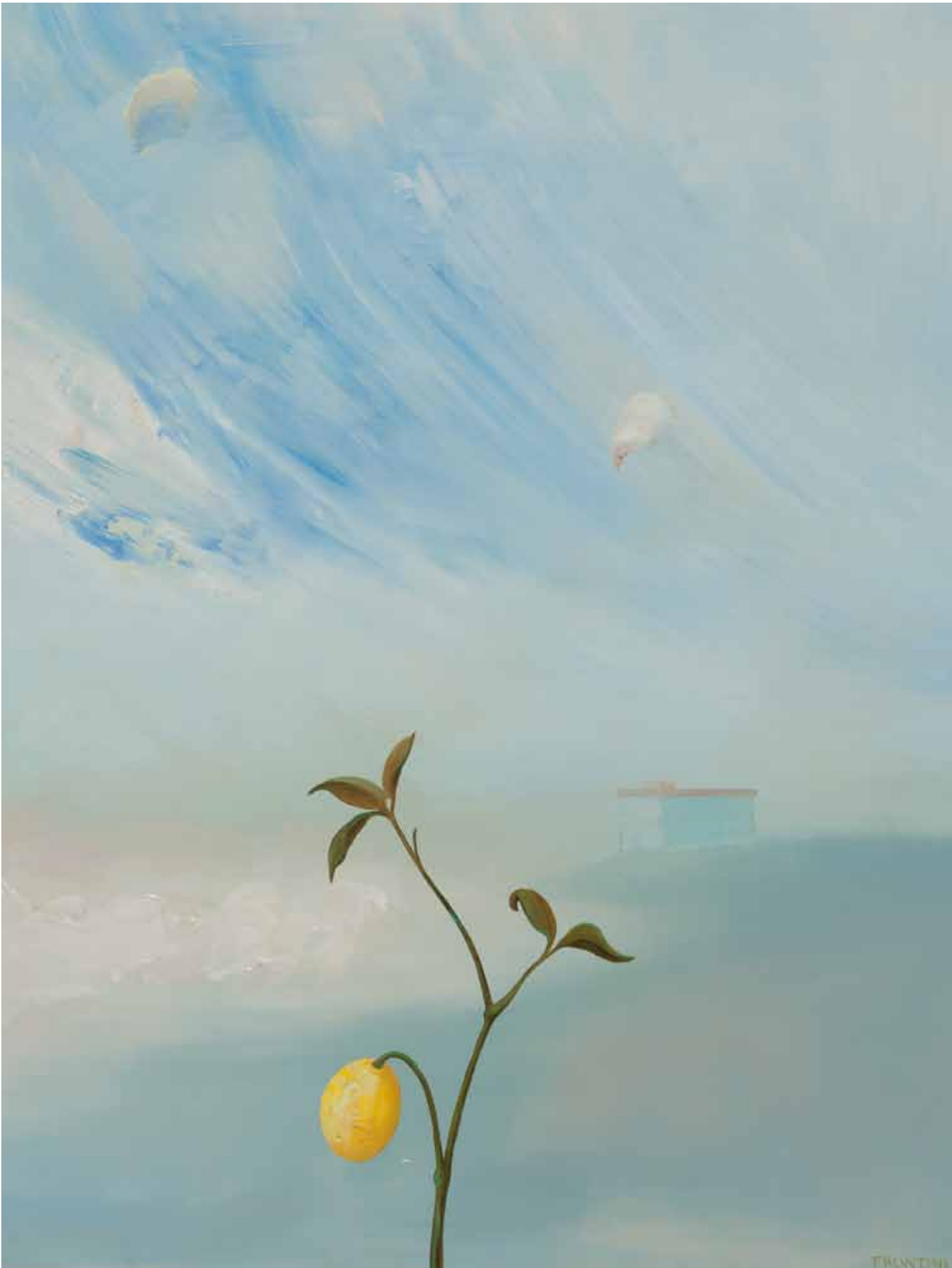
Cumquat, 2013, oil on panel, 14”x 11”