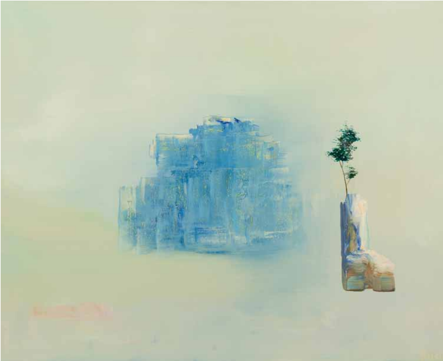
Blue City, Hermits Ruin, 2013, oil on panel, 5"x 7"